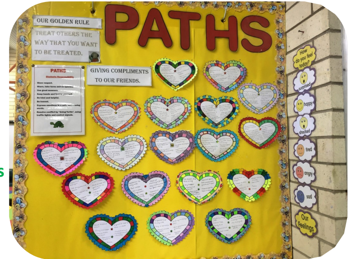
PATHS Compliments Wall

I like being the PATHS kid because I can wear the badge, sit on the chair and hand out work. King